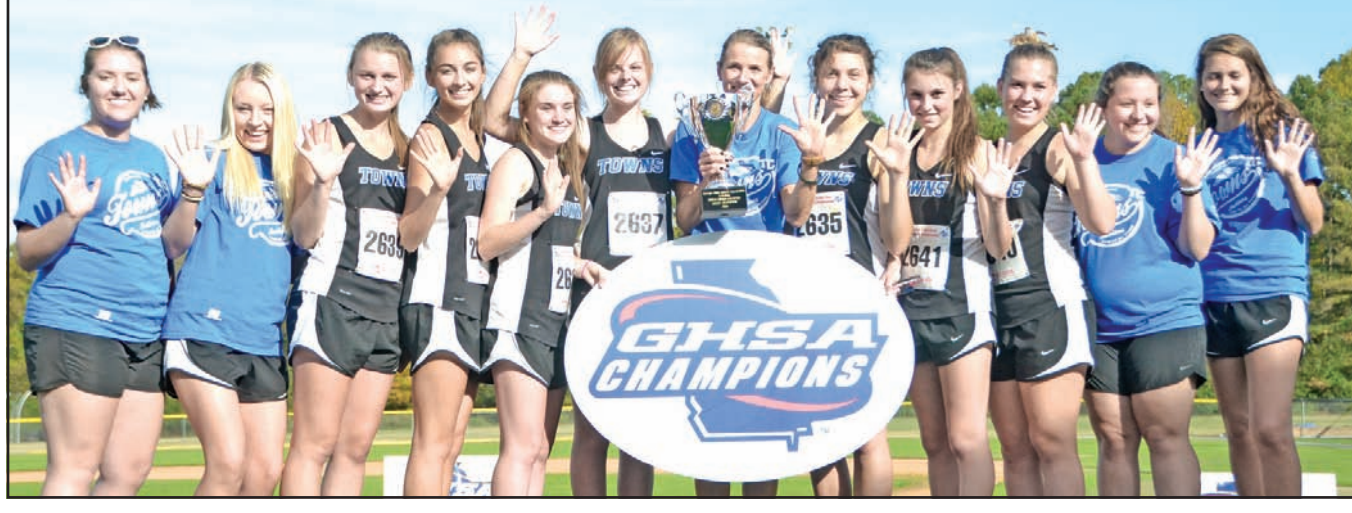
Towns County High School Lady Indians – 2016 GHSA Class A Public State Champions (Fifth Year Running)