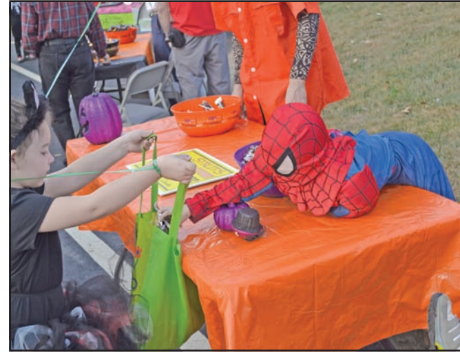
The 2016 Hiwassee Halloween on the Square was another huge success for both the city and its little candy warriors.